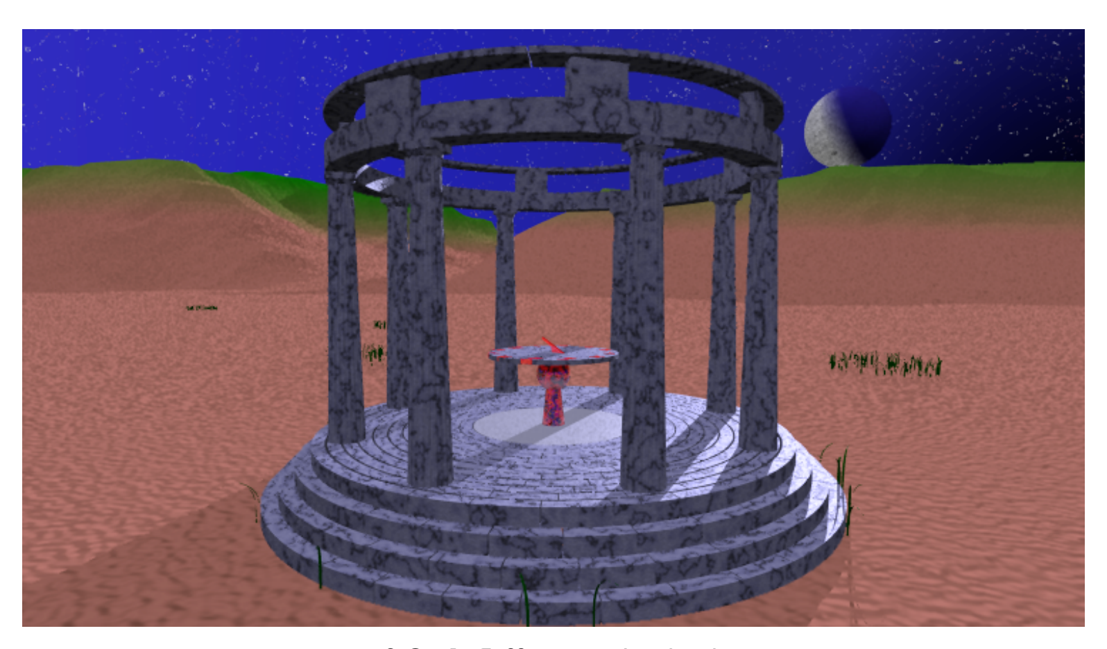
A Gods & Monsters Lorebook